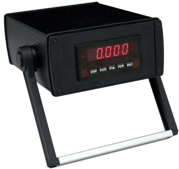
Table housing for informators model E1930 / E1931